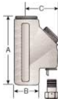
Type EYDX 1/2" - 3/4"